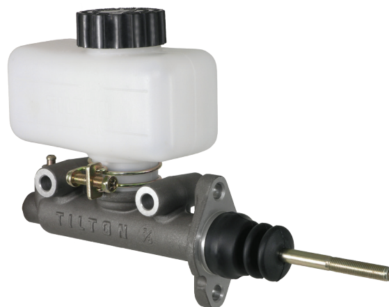
Diagram 1 - Master Cylinder Kit and Replacement Parts