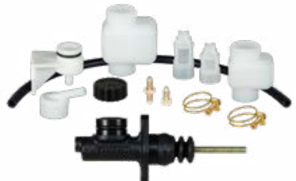
3/4" Tilton 75-Series Cylinder Kit (P/N 75-750U)

See all Tilton master cylinder kits at tiltonracing.com